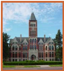
Fillmore County Courthouse

Take this opportunity to join with others in Fillmore County and become a member of the FCDC..