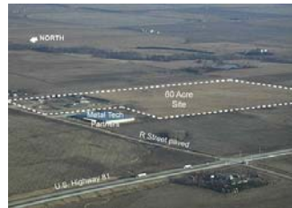
Industrial Site, R Street, Geneva